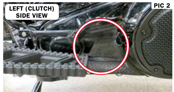
LEFT (CLUTCH) SIDE VIEW

Note: If the bike is going to be operated before full bonding occurs, secure the Accent to the bike with a good quality masking or painter's tape.