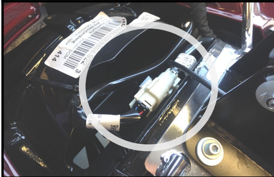
Harness Connector Location—Top Rear Fender

For: Road King, Electra Glide Ultra Classic, Electra Glide Ultra Classic Lo, Electra Glide Ultra Limited, Electra Glide Ultra Limited Lo, Road Glide Ultra CVO