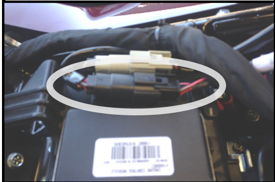
Harness Connector Location—on top of ECM

For: Road King, Electra Glide Ultra Classic, Electra Glide Ultra Classic Lo, Electra Glide Ultra Limited, Electra Glide Ultra Limited Lo, Road Glide Ultra CVO