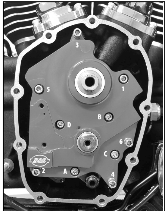
Picture 3: Cam Support Plate Screws (1-6) and Oil Pump Screws (A, B, C, D)